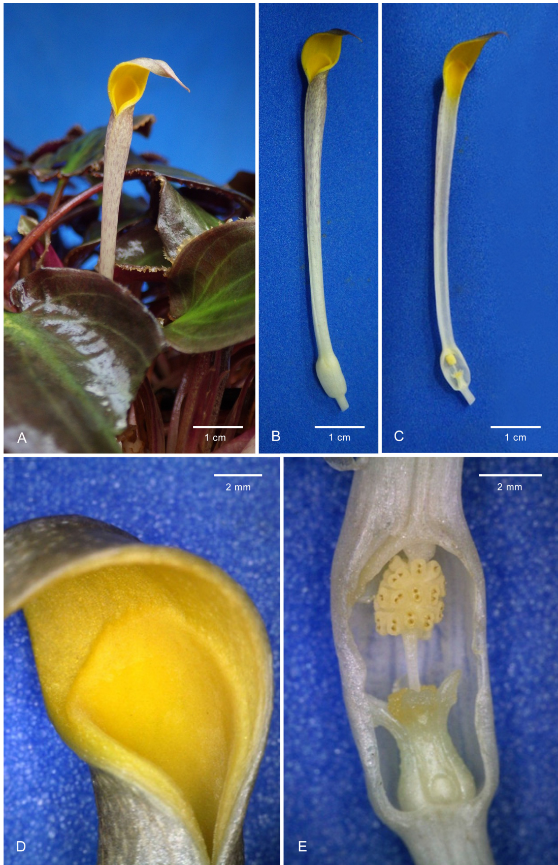
Fig. 5. Cryptocoryne aura – A: plant showing limb of spathe slightly subobliquely twisted (older spathe); B: limb of spathe bent forward at a younger stage than in A; C: spathe longitudinally cut open showing kettle in lower part; D: limb of spathe showing slightly raised collar; E: opened kettle showing female flowers below, olfactory bodies (yellow) above, sterile interstice, and male flowers above.