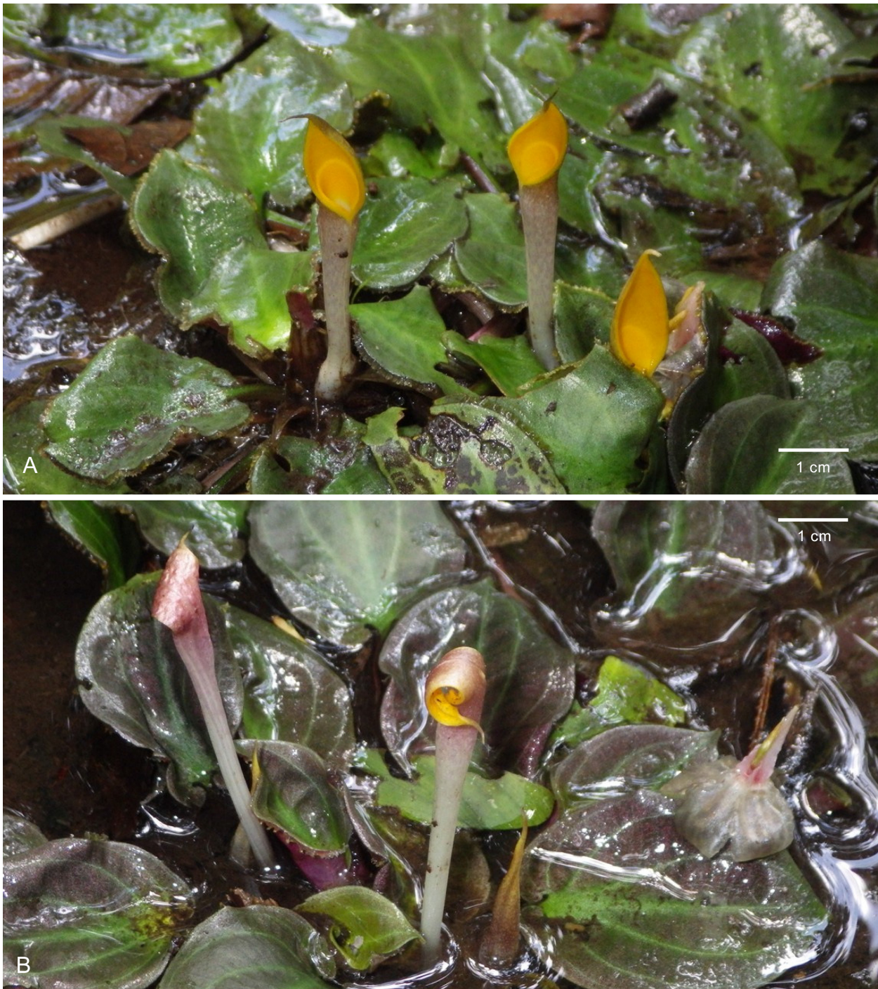
Fig. 3. Cryptocoryne aura , close-up of plants in Fig. 2. – A: newly opened spathes showing subobliquely twisted limb; B: older spathes showing forward-twisted limb. – Photographed on 26 February 2015 by S. Wongso.

Most species of Cryptocoryne have a rather undifferentiated embryo, which pushes through the distal end of the seed (micropylar end), and the root hairs can be seen at the “tip” of the embryo; just behind that, the plumular processes (prophylls) are seen pointing “backwards”. After further growth, more roots and leaves appear. Most of the embryo remains inside the seed, where it serves to absorb the endosperm in order to feed the growing embryo during the initial stages. There are a few exceptions to this simple embryo in