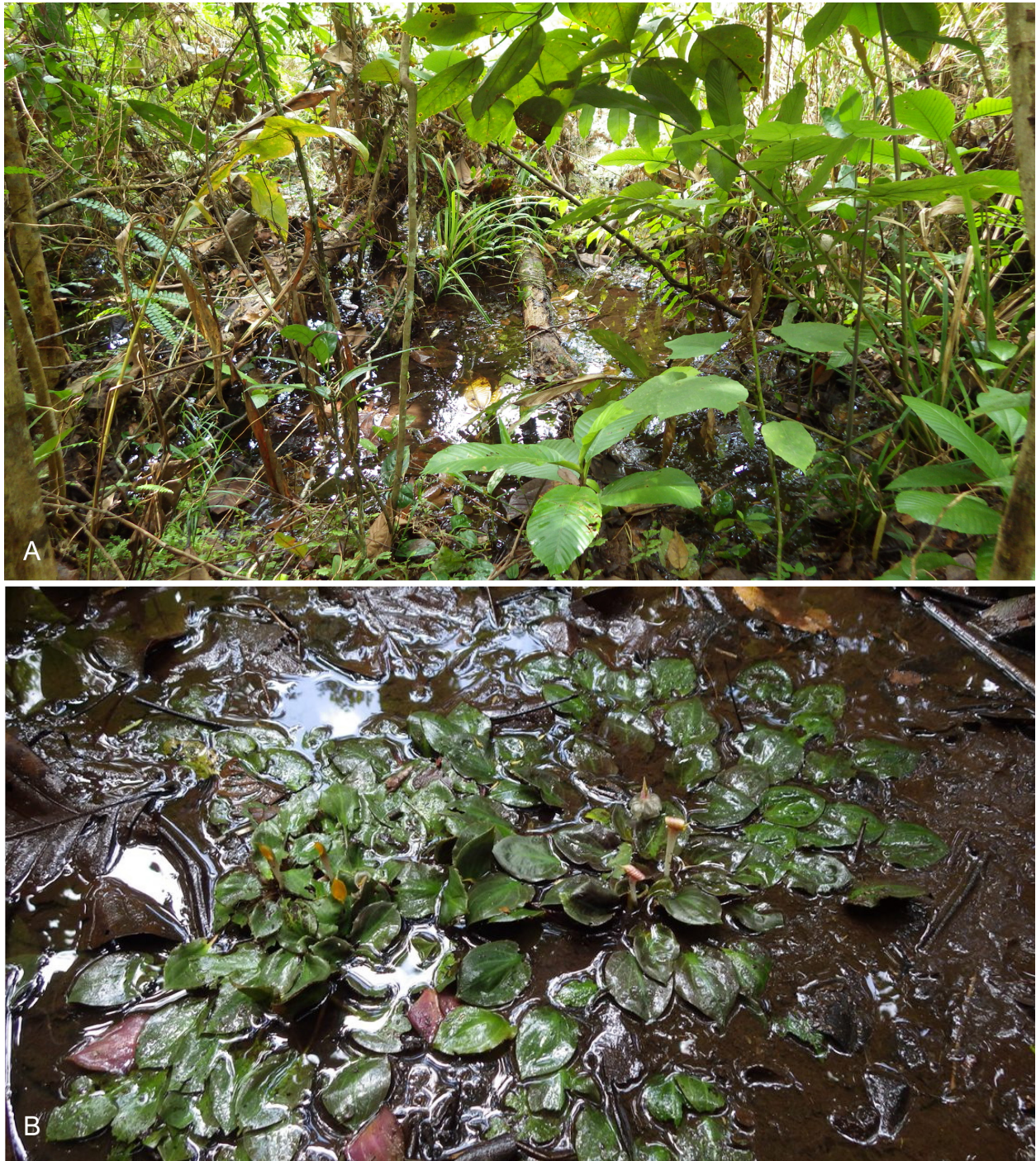
Fig. 2. Cryptocoryne aura – A: habitat at type locality with slower-flowing water; B: close-up of plants in A. – Photographed on 26 February 2015 by S. Wongso.

Etymology — The epithet alludes to the well-developed, slightly transparent, whitish membrane surrounding the leaf margin, which is likened to an aura.